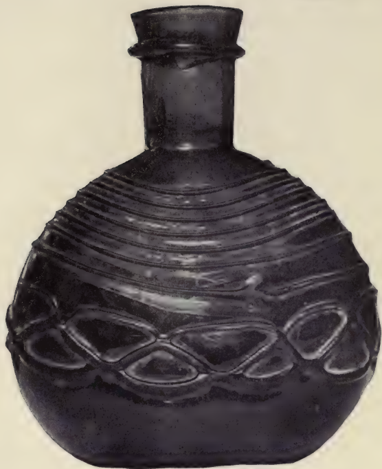
FLASK Maria Province of Almería